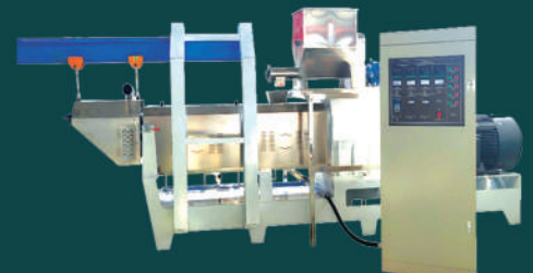
Screw -95 - PLC