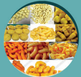
Puffed Snacks Pets & fish feed