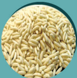
FRK (Nutrition Rice)