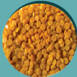
Analogue dal (Toor dal)